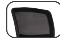
Mesh back with PP Frame