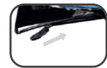
Upright Position Back Tilt Lock