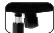
Backrest Tilt Tension Adjustment