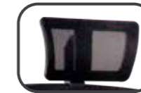
Ergonomic / Adjustable Headrest