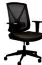
with 3D Arm