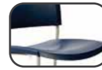
Attractive Design with easy-care plastic shell

Colorful and fun, Mant-O is the perfect chair for the office cafeteria. It's minimalist design and clean lines impart a neat, fuss-free look. Lightweight, durable and stackable, Mant-O is available in a variety of colors that are guaranteed to make the cafeteria a great place to take a break in.