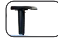
Fixed/2D Arm Adjustment