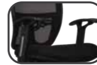
Choice of Fixed or Adjustable arms