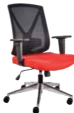
with polished aluminium base