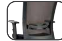
Mesh back with PA frame