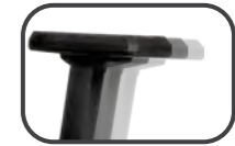
1D / 3D Arm Adjustment