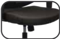
Synchronized Tilt Mechanism