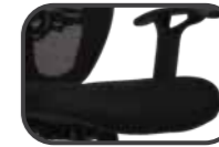
Special Fabric Seat with PU Foam