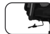
Pneumatic Seat Height Adjustment