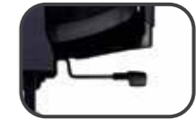
Seat Height Adjustment