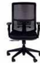
With Fixed Arm