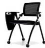
With Tablet & Castors