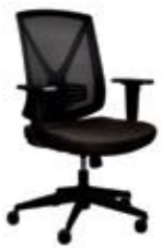
with 1D Arm