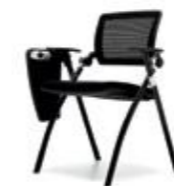
With Tablet & Glides