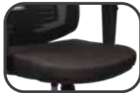
Seat with Moulded PU Foam