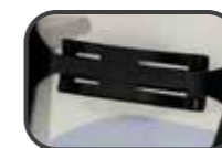
Adjustable Lumbar Support