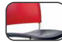
Dual tone colors back & seat in 2 different colors