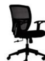
with Fixed Arm