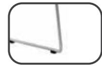
Sledge Base in silver color