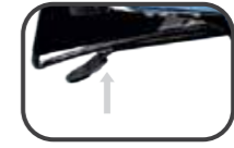
Seat Height Adjustment