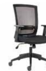
with nylon base