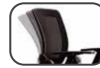
Dynamic Pivoting Back