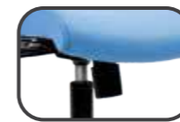
Backrest Tilt Tension Adjustment