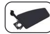
Foldable Writing Tablet with Cup Holder