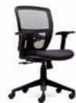
with 1D Arm