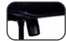
Synchro Tilt Mechanism