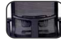
Adjustable Lumbar Support