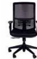
With 1D Arm