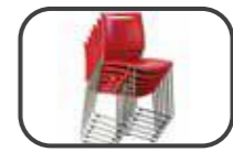
Easy to Store stackable upto 5-high