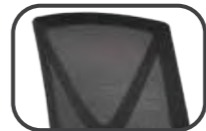
Mesh Back with PA Frame

Ativo with its timeless design, dynamic support & sleek contoured looks, offers the kind of active comfort that makes it easy to sit for hours. If your need is a supremely comfortable, exceptionally stylish office chair, you should opt for Ativo.