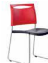
MANT-O (Dual colour)