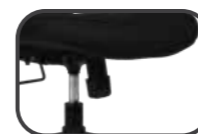
Synchronized Tilt Mechanism