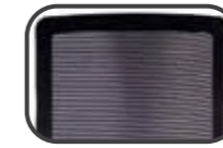
Black wire mesh