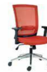
with polished aluminium base